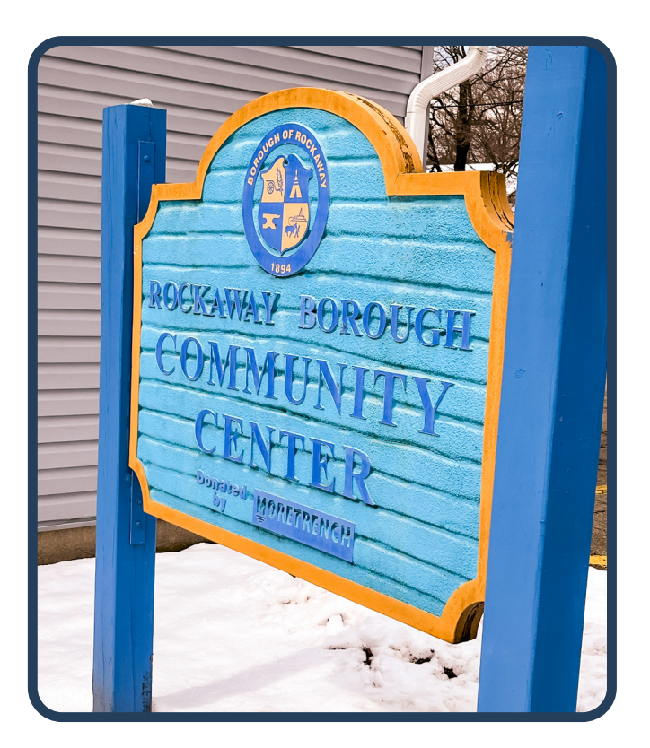
ALL MEETINGS HELD AT THE COMMUNITY CENTER UNLESS OTHERWISE NOTED

Click here for meeting schedule, minutes and agendas.